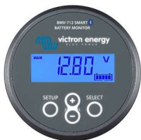
Bluetooth sensing BMV-712 Smart Battery Monitor